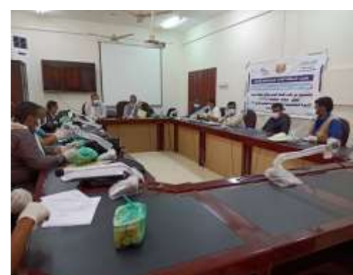
FIGURE 5 NFDHR ACTIVITIES DURING DECEMBER 2020