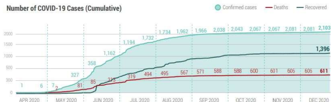
FIGURE 1 COVID-19 CASES REPORTED FROM SOUTHERN GOVERNORATES- TILL END OF DECEMBER 2020.

Health partners are continuing to provide support to several aspects of COVID measures in the non-COVID health facilities they support.