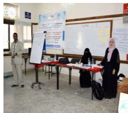
FIGURE 6 BFD ACTIVITIES DURING DECEMBER 2020

*** Attached to this bulletin are success stories by Health Cluster partners UNICEF and Abs Development Organization for Woman and Child (ADO).