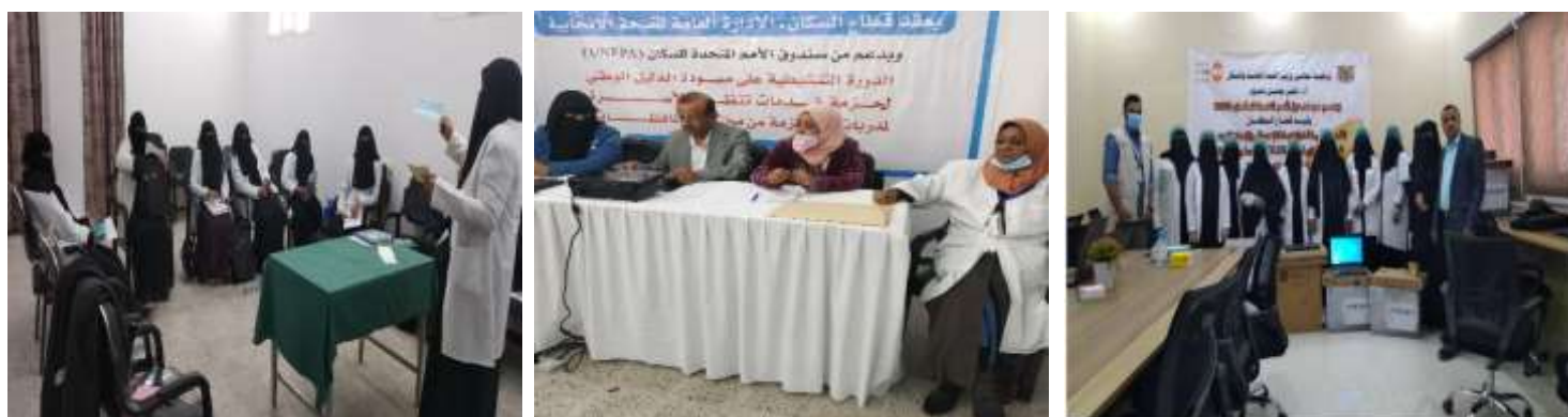
FIGURE 3 UNFPA ACTIVITIES DURING DECEMBER 2020