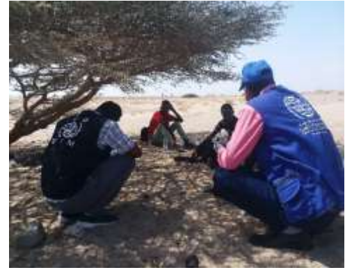
FIGURE 4 IOM ACTIVITIES DURING DECEMBER 2020