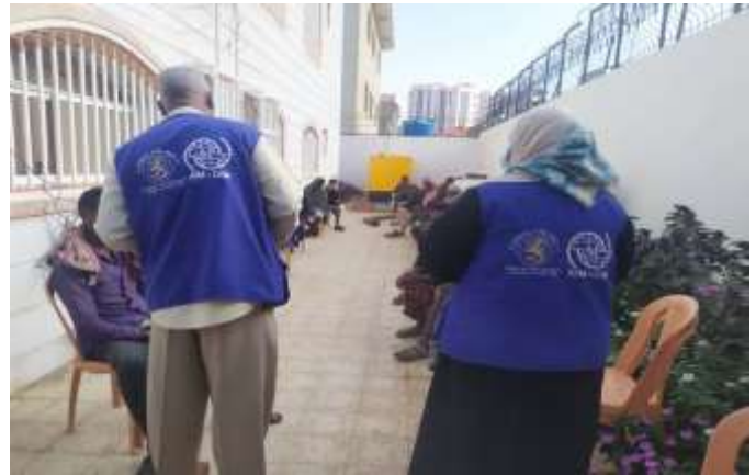
FIGURE 3 IOM ACTIVITIES DURING JANUARY 2021