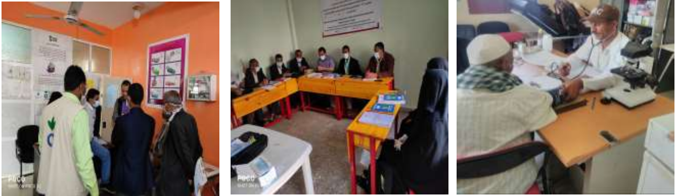
FIGURE 4 ACF ACTIVITIES DURING JANUARY 2021