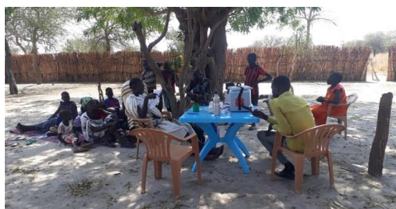
HFO: Attending patients at EPI outreach sites

South Sudan Emergency type: Complex Emergency