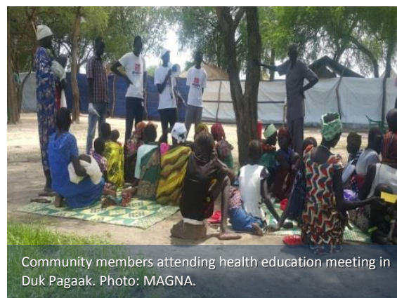
Community members attending health education meeting in Duk Pagaak.