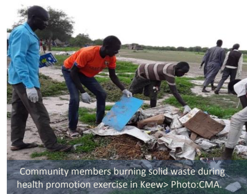
Community members burning solid waste during health promotion exercise in Keew.