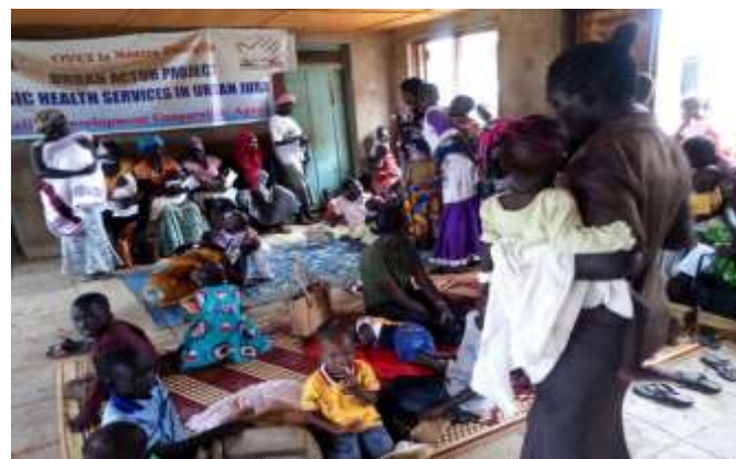
OVCI health service in Juba.

South Sudan Emergency type: Complex Emergency