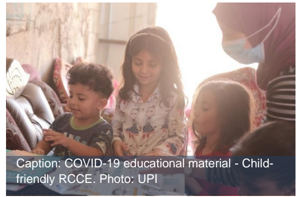
Caption: COVID-19 educational material - Child-friendly RCCE.