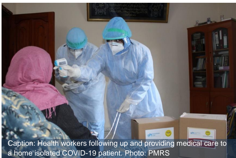
Caption: Health workers following up and providing medical care to a home isolated COVID-19 patient.