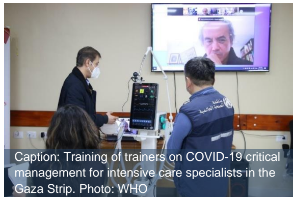
Caption: Training of trainers on COVID-19 critical management for intensive care specialists in the Gaza Strip.