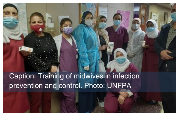
Caption: Training of midwives in infection prevention and control.