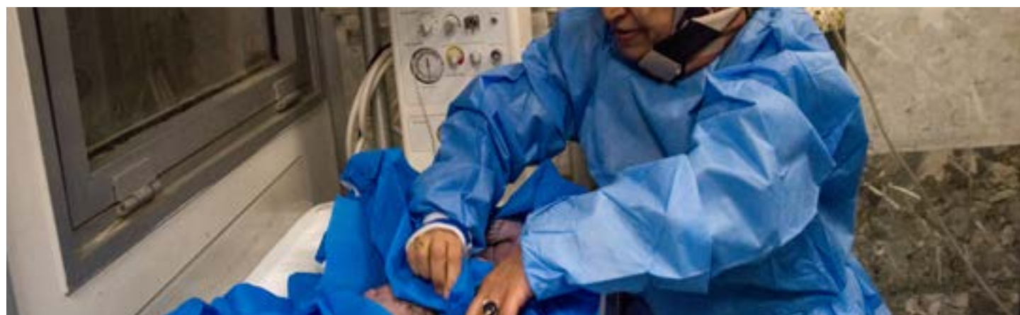
A medical personnel attends to a new born baby in one of the UNFPA supported health facilities

UNFPA also provided training on the Minimum Initial Service Package (MISP) in reproductive health to different health actors, training more than 150 providers in 2017, as well as trainings on clinical management of rape. Additionally, UNFPA provided emergency reproductive health kits to the different RH working group partners. The working group also endorsed the guidelines to work towards the harmonization of services among different actors.