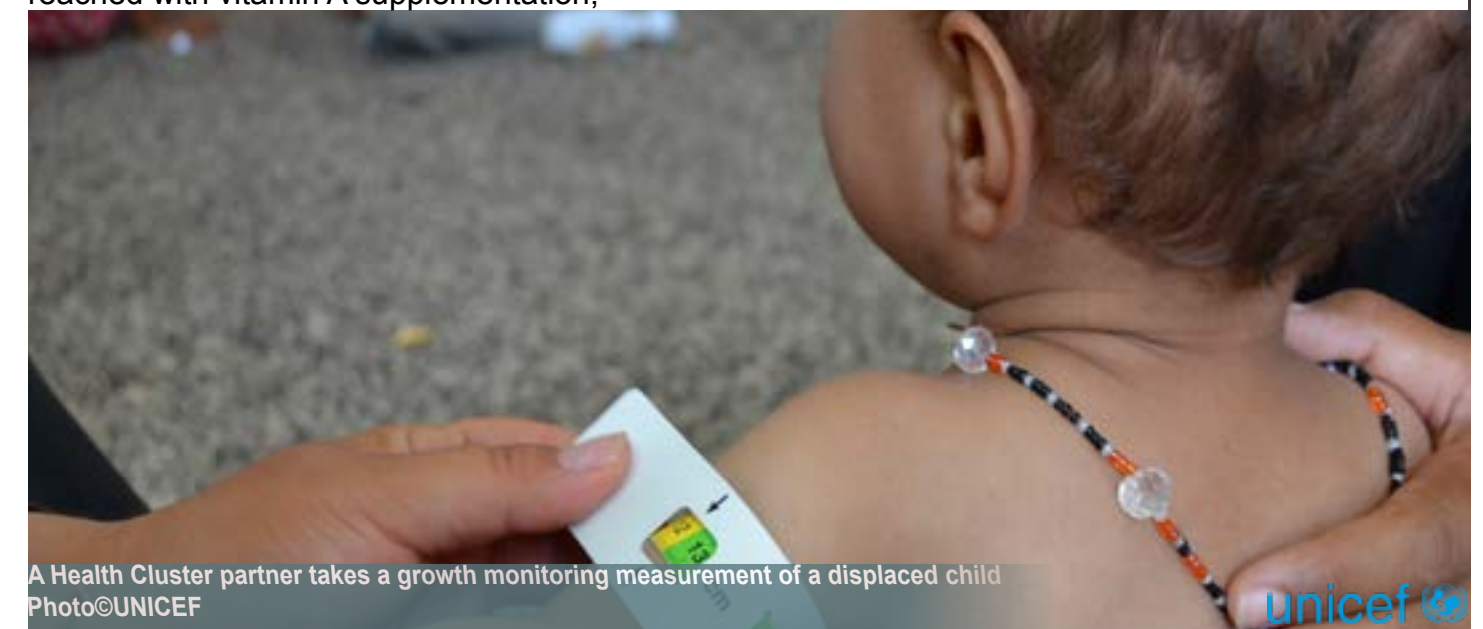
A Health Cluster partner takes a growth monitoring measurement of a displaced child