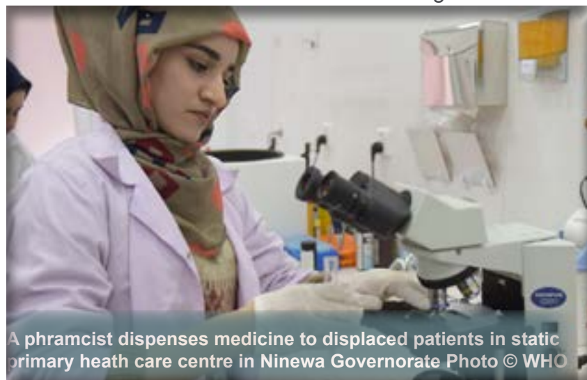
A pharmacist dispenses medicine to displaced patients in static primary health care centre in Ninewa Governorate

A food-borne illness incident occurred in Hasansham U2 camp on the 12th of June; health Cluster partners responded swiftly in coordination with DOH Ninewah and Erbil. Partners provided immediate life-saving response to manage patients with severe vomiting and through referral to their PHCC in Hasansham U3 camp). Of the 825 reported cases, 638 were referred to various health facilities, 386 cases having been admitted to hospitals within Erbil.