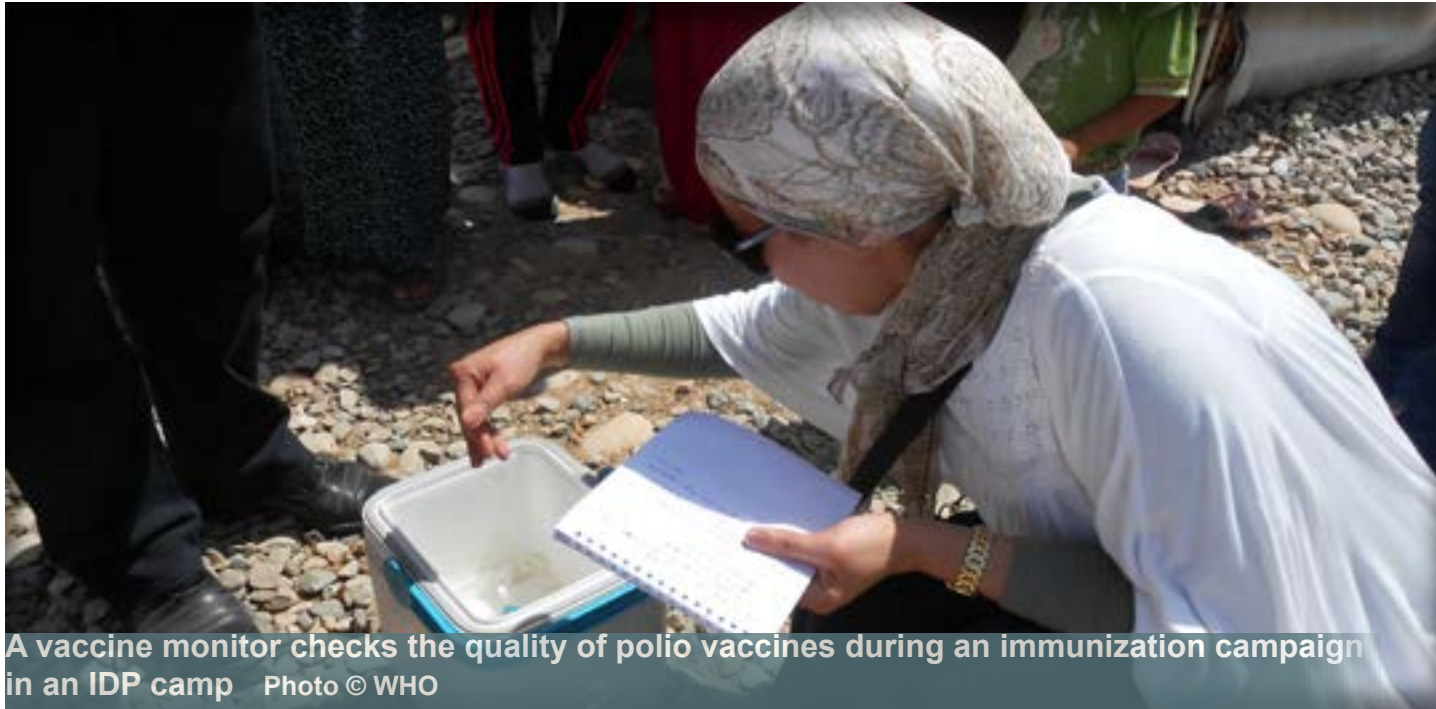
A vaccine monitor checks the quality of polio vaccines during an immunization campaign in an IDP camp