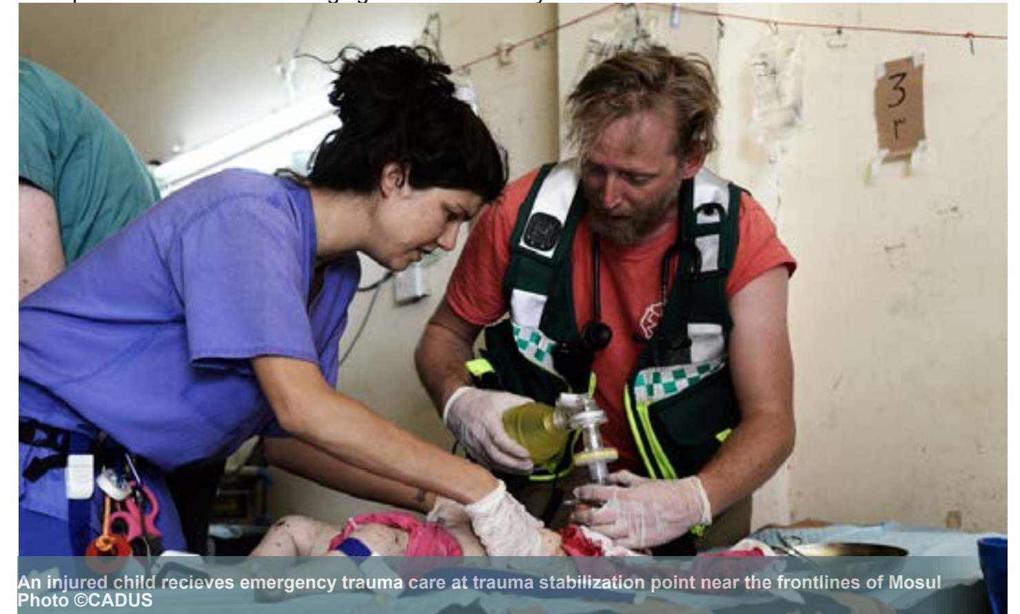
An injured child receives emergency trauma care at trauma stabilization point near the frontlines of Mosul

Subsequent to the conclusion of the military operations in Mosul, Hawija and west Anbar, the working group shifted focus of the field hospitals to the delivery of comprehensive secondary health care services, relocating and handing off the hospitals to the government as soon as they had the capacity to run them.