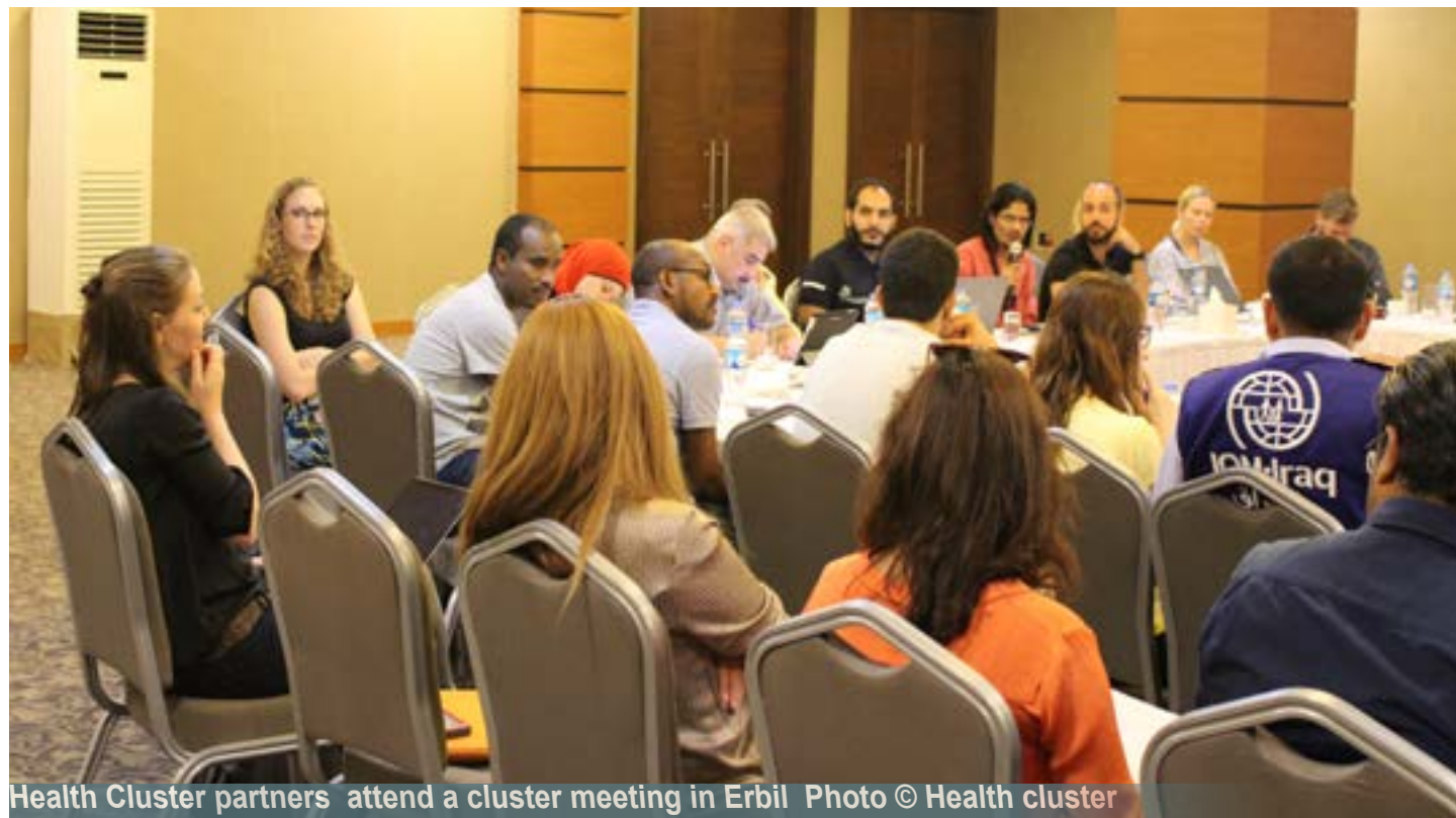
Health Cluster partners attend a cluster meeting in Erbil

6.2 million people affected by the conflict were reached during 2017, primarily through life-saving interventions, including trauma management, emergency primary healthcare services and sustaining a steady supply of essential medicines and supplies.