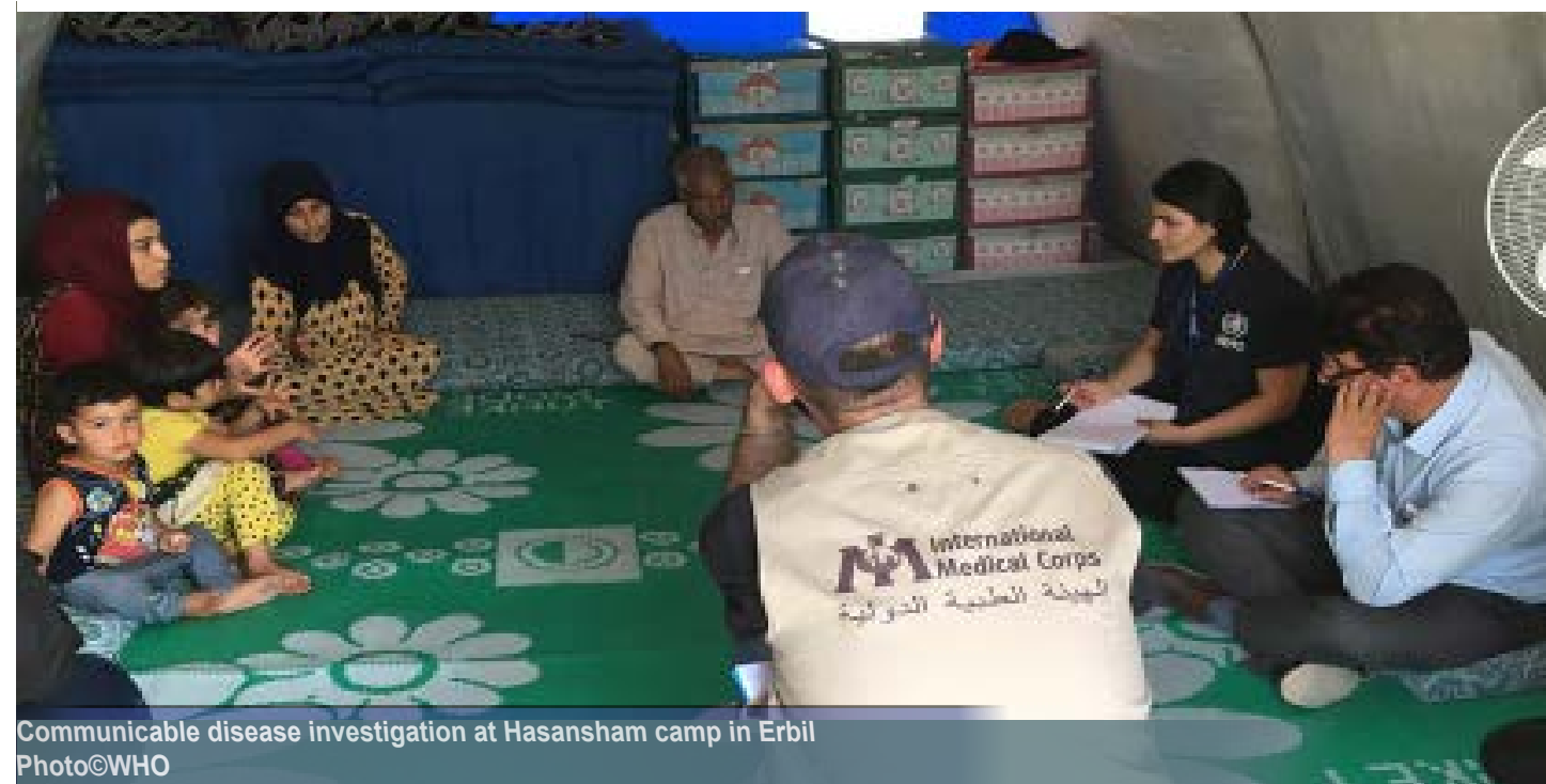
Communicable disease investigation at Hasansham camp in Erbil

The SAG was instrumental in the strategic and technical reviews of the projects submitted under the Humanitarian Pooled Fund (HPF) that had three allocations during 2017 (First Standard, Reserve and Hawija). This is in addition to supporting the development of the health component of the HRP 2018, including both the Humanitarian Needs Overview (HNO) and the Response Plan.