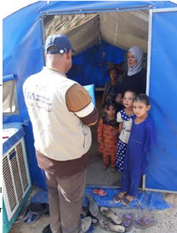
Mental health and psychosocial services outreach worker visiting Jedaa camp: Photo©International Medical Corps.